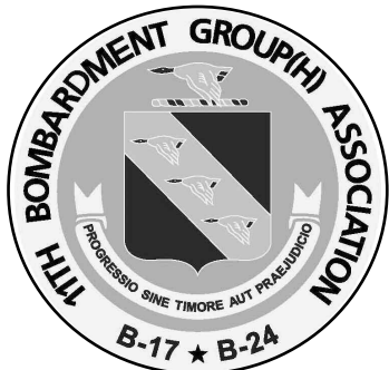
11th BGA Challenge Coin (back)