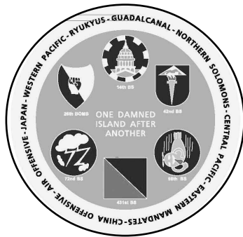
11th BGA Challenge Coin (front)

Please list extra islands and number of nights you are interested in and we will call you to discuss.