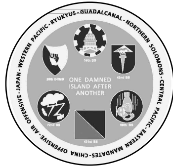
11th BGA Challenge Coin (front)

Please list what nights you would like to add.