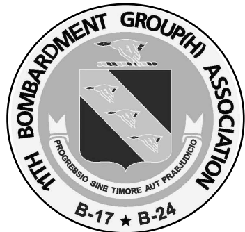
11th BGA Challenge Coin (back)